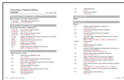
Japanese/ English bilingual text in the book (left), Chronology of Japanese History (right)